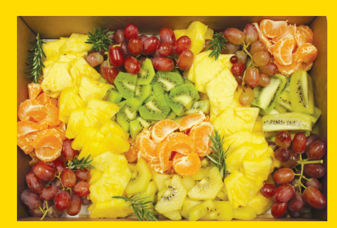
Fresh Fruit Platter